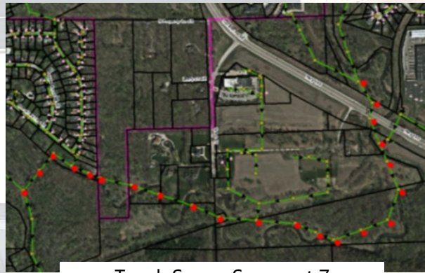
Trunk Sewer Segment 7