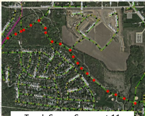
Trunk Sewer Segment 11

Design is complete for Segment 7, letting date to be determined. Veenstra & Kimm continue design for Segment 11.