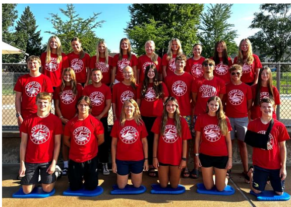
Some of the 2024 pool staff (left) and recreation staff (below).

Art Gallery: There was no art display scheduled in July, so The Gallery received a fresh coat of paint.